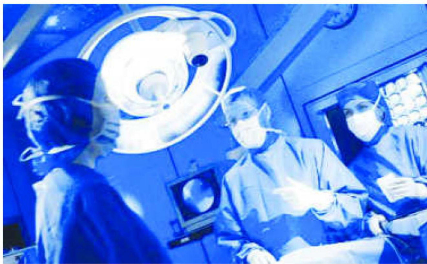
60,000 MBBS seats in India currently, which may increase under the new system

Will replace MCI, proposes exit exams for MBBS passouts, end of inspector raj, cap on fee in pvt colleges