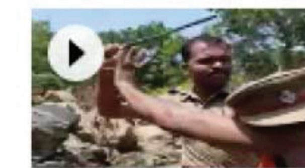
On Cam: Tourists at Hogenakkal Falls in Tamil Nadu beaten