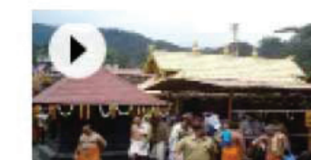
Supreme Court lifts ban on entry of women in